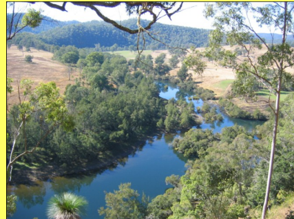
Nymboida River—Reach 1 (Between The Junction and Pollack Bridge)

More details will be emailed so if we don't have your email please inform us or ring to register an interest in the workshop and we will mail you further information.