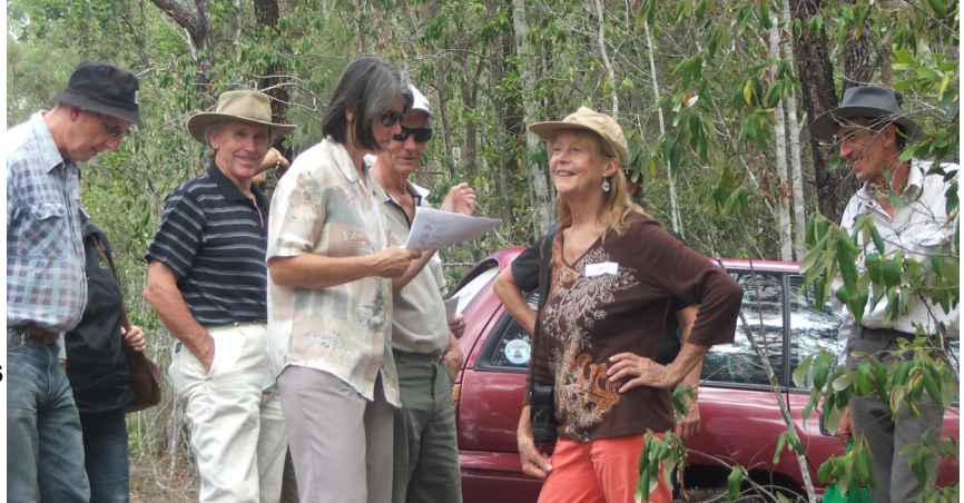
Workshop participants enjoying their day identifying plants at the Bryant property, Kangaroo Creek.

As part of the Biodiversity Resource Support Project funded by the Australian Governments Clean Energy Future program, Clarence Landcare recently held two workshops designed around native species that are difficult to identify and also useful for revegetation projects. While the Coutts Crossing community Hall was the venue for a stimulating morning for people interested in better knowing their eucalypts, corymbia and angophoras, the Maclean workshop focused on rainforest species. Both events promoted the collection and storage of seed from the full gamut of native species, for reforestation and rejuvenation of sites across the Clarence Valley and floodplain.