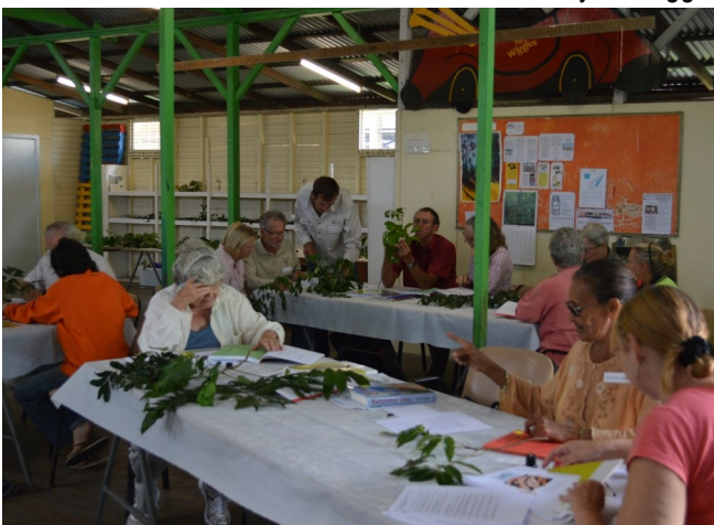
Participants keying out samples at Rainforest workshop

"Before today, I struggled with plant identification"