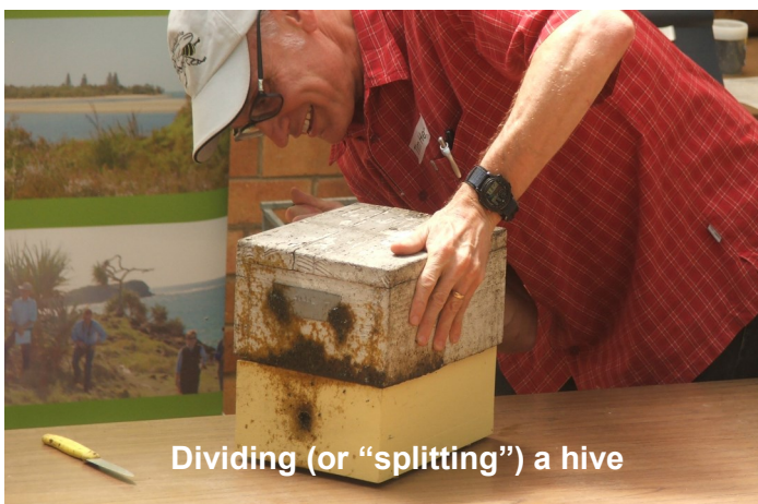
Dividing (or "splitting") a hive

Further information: www.sugarbag.net . This is Tim Heard's site and has a range of info including how to make your own hives or buy empty or fully stocked