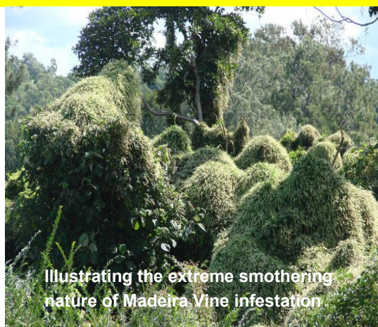
Illustrating the extreme smothering nature of Madeira Vine infestation