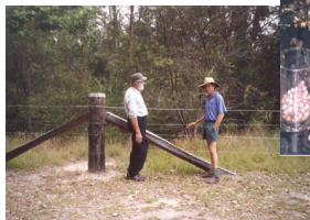
Protecting & rehabilitating creeks, riverbanks & wetlands to improve habitat, soil stability & water quality on private & public land.