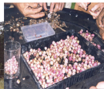
Workshops & Training.