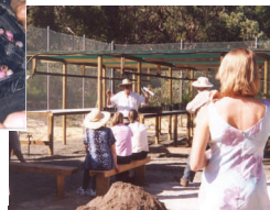
Sandon to Wooli Community Nursery. A Coastal Community Partnership.