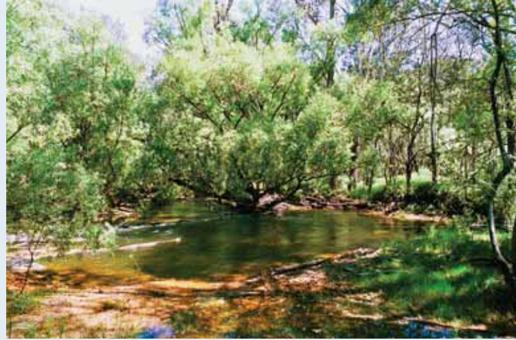
Willows can dominate riparian areas and have significant impacts of ecosystem functions.

Reproduction by seed allows willows to spread widely across the landscape. It is a particular management problem with two species—black willow ( S. nigra ) and grey sallow ( S. cinerea ), but many other willow species are also capable of producing viable seed. Willow seed can be spread via water or wind. The seeds are very small and light, and can be blown several