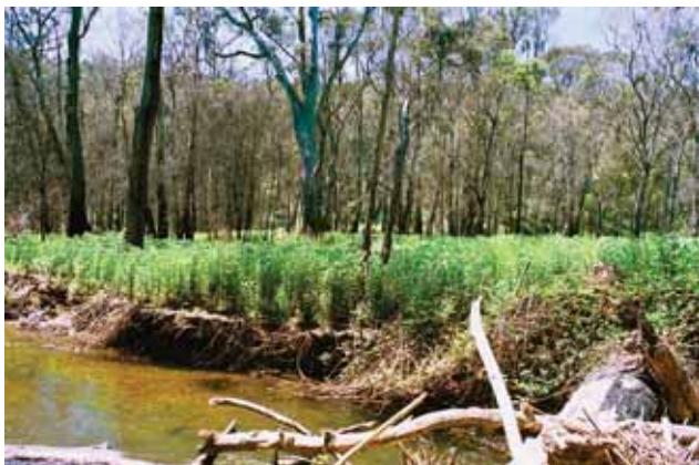
Infestation of caper spurge on the upper Ovens River, north-east Victoria.

It should be noted that much evidence about the impacts of weeds on these processes is based on anecdotal observation, rather than on scientific analysis which has been limited. However, in some instances such analysis does support commonly held assumptions. For example, recent (as yet unpublished) studies by scientists at the Commonwealth Science and Industrial Research Organisation (CSIRO) have demonstrated that willows do use more water than native river red gums in equivalent circumstances, thus validating assumptions that willows can have a negative impact on water quantity.