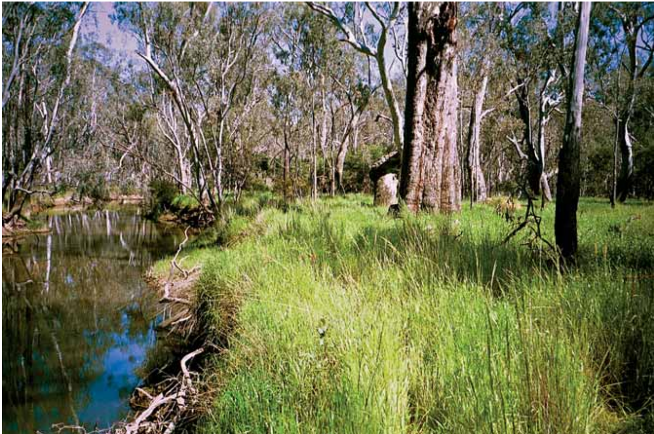
Riparian grassy woodland along the lower Ovens River, north-east Victoria.

The information gained from monitoring should also be integrated into the development of new weed management programs.