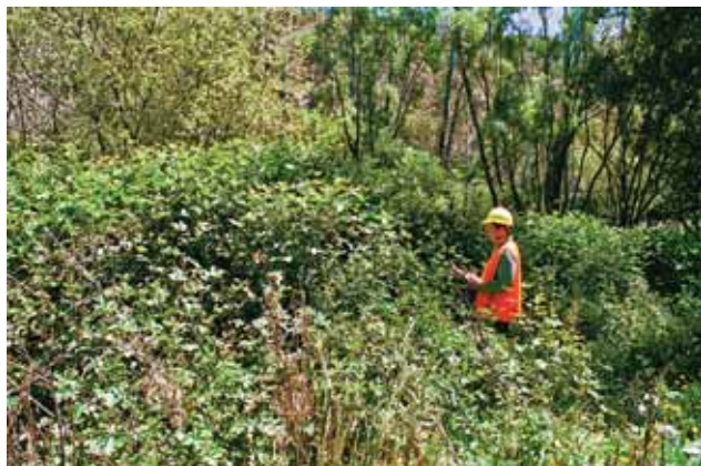
Blackberry thickets can reduce recreational access to rivers.

Weeds can have a number of impacts within riparian areas, but it is important to assess the likely impacts at a particular site rather than making assumptions based on generalisations.