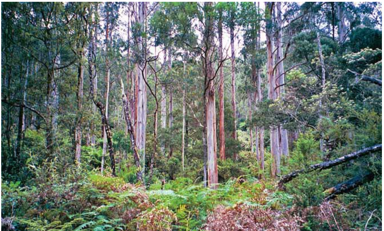
Healthy riparian forest on the Barwon River, Otways, Victoria.