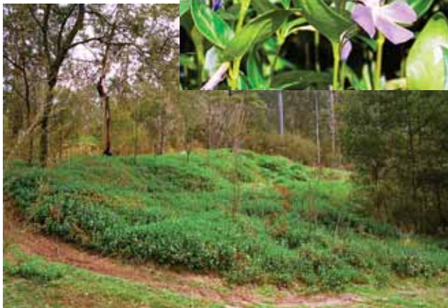
Blue periwinkle can form dense mats of herbaceous vegetation in riparian areas. Stem fragments of blue periwinkle are dispersed over long distances via flood events.