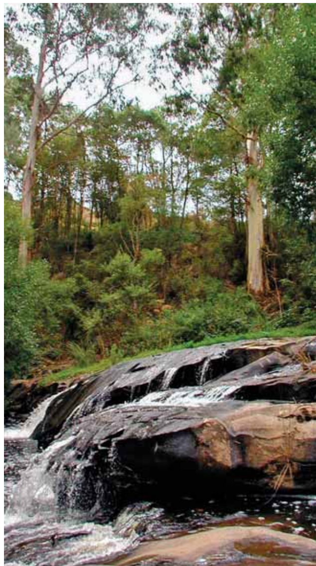
Franklin River, Gippsland, Victoria.