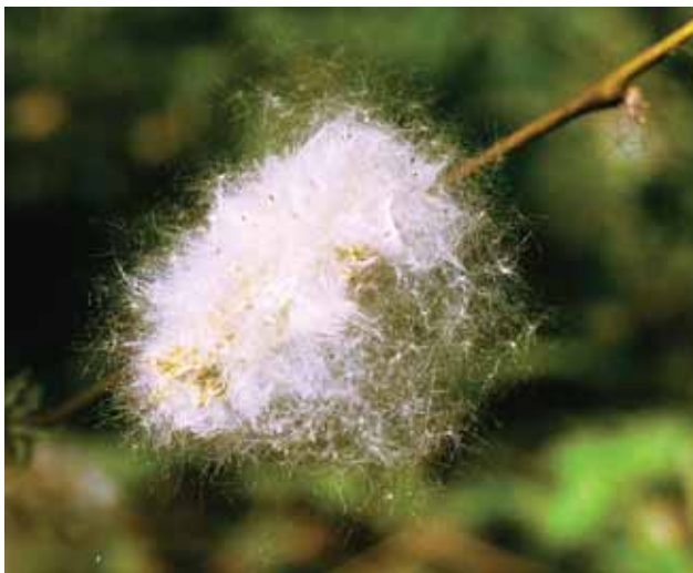
Willow seeds ripe for dispersal.

These newly created recruitment sites of bare sediment, free of competing vegetation, can provide establishment sites for weeds or native species. It is important therefore, to understand whether or not regeneration processes of key native species are strongly tied to flood events. If so, post-flood weed management activities need to be undertaken with extreme care to prevent damage to native seedlings. In riparian areas where post-flood native regeneration is important but lack of seed is limiting, flood events may provide the ideal opportunities to undertake direct seeding or planting.