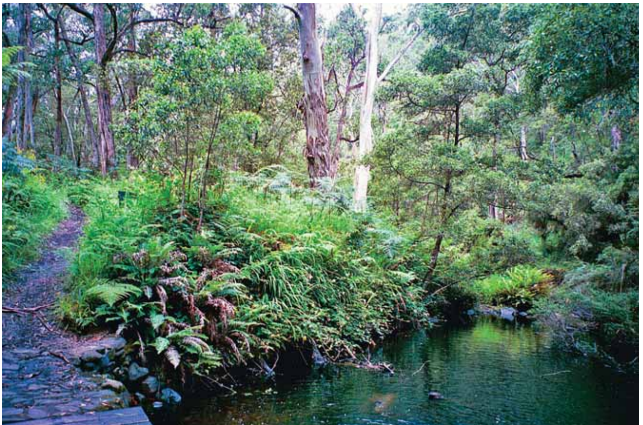
Riparian areas provide environmental and social benefits. St Georges River, Otways, Victoria.