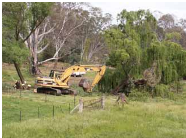
Physical removal of trees in riparian areas presents many challenges and is only appropriate in some situations.

In the early stages of an infestation, hand-pulling may be sufficient to remove the weeds from a site. In areas with high levels of native vegetation and relatively few weeds, manual removal is often the best management option.