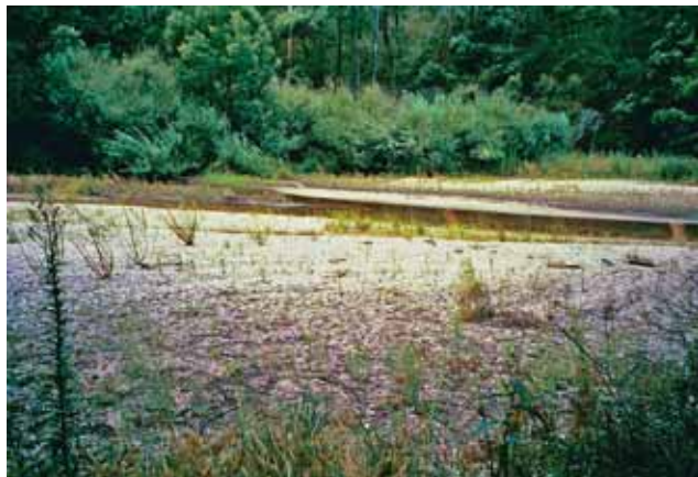
Low flows can provide new sites for weed invasion.