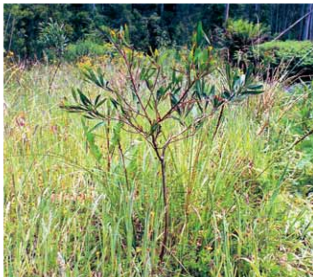
Native seedlings and weeds often establish in close proximity, complicating weed management.

As riparian areas often contain many weed species it is important to determine whether all species should be controlled, or whether management actions should focus on key weed species. It is also important to prevent re-invasion of areas which have been cleared of weeds.