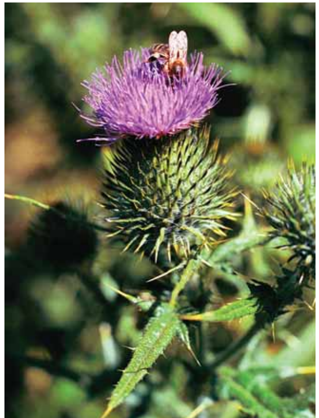
Thistles are ubiquitous in the landscape, but are unlikely to transform habitat.

A list of weeds commonly found in riparian areas in south-eastern Australia, particularly Victoria, and their natural dispersal mechanisms is given in Appendix 1.