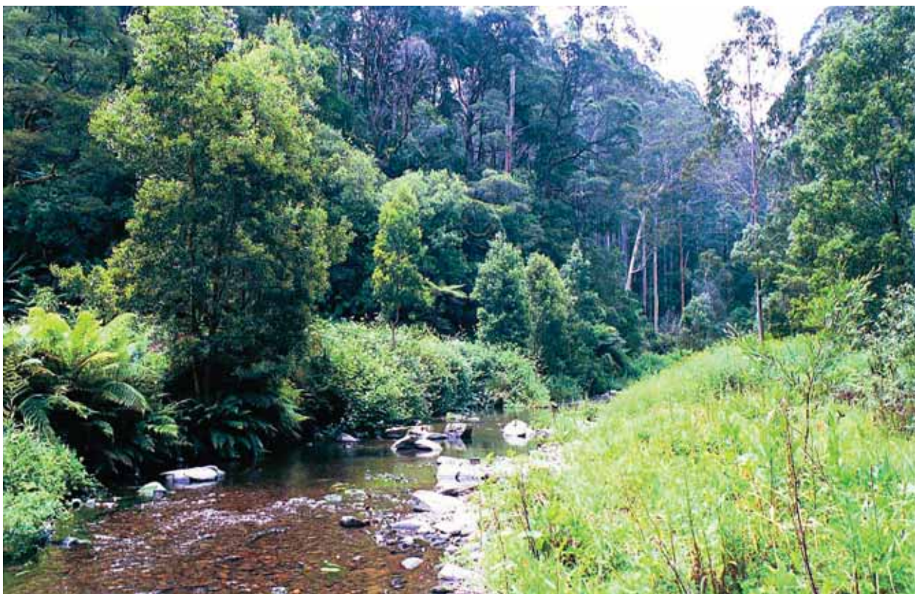
Healthy riparian vegetation containing limited weeds along the Barham River, Otways, Victoria.

Potential sources of weeds need to be considered in the development of a riparian weed management program and may require activities to be undertaken in areas located away from the river corridor. For weed species which are primarily dispersed via water, initiating weed management in upper catchment areas is likely to provide a degree of weed control in the riparian area being managed and in riparian areas further downstream. However for weed species which disperse over long distances by other mechanisms, it is not safe to assume that weed management in upstream areas will provide adequate protection to areas downstream. Instead management may be better targeted at eliminating